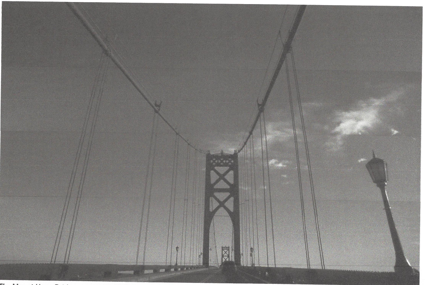
The Mount Hope Bridge, opened in 1929, connects the Rhode Island towns of Bristol and Portsmouth, Rhode Island. LANE

By Edward Fitzpatrick Globe Staff, Updated July 28, 2021, 4:35 p.m.